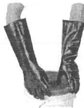
Chemical Resistant Gloves