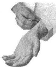
Disposable Nitrile Gloves